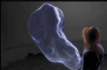
Area needed for sharp vision within arm's length

VARILUX® X SERIES™ LENSES ARE DESIGNED TO MAXIMIZE THE PROGRESSIVE WEARERS' VOLUME OF VISION