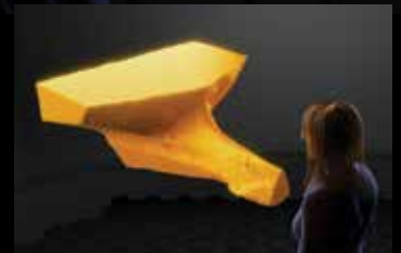
Varilux X Series Lenses