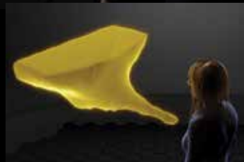
Ordinary Progressive Lenses