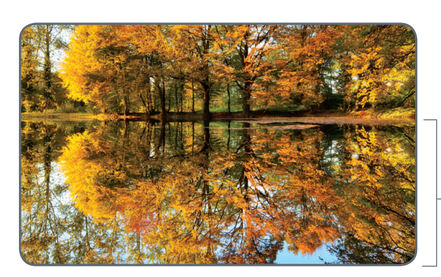
Lake reflection without distortions