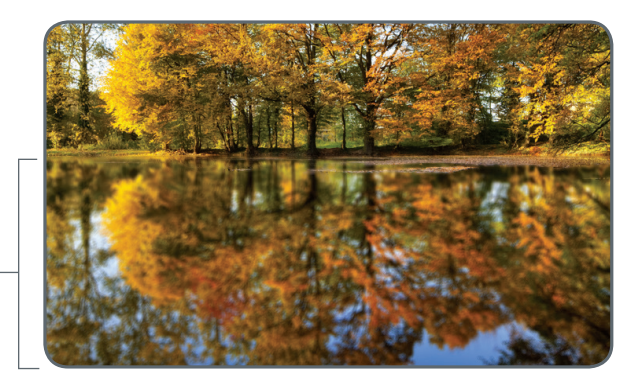
Lake reflection with distortions

All progressive lenses have distortions caused by changes in curvature across the lens surface. These distortions reduce the perception of contrast and sharpness.